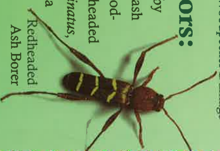
Redheaded Ash Borer

Ash may also be stressed by drought, diseases such as ash yellows, and by native wood-boring insects like the redheaded ash borer, Necythus acuminatus , (Fabricius) which creates a round emergence hole.