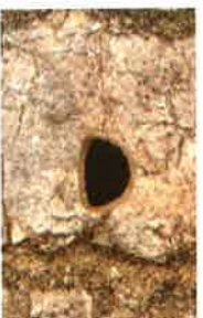
D-Shaped Emergence Hole

Eggs are laid between layers of bark and in bark crevices. Larvae hatch in about one week and bore into the tree where they feed on the inner bark and phloem, creating “S”-shaped galleries. Larvae go through four feeding stages, and then excavate a pupal chamber in the fall, where they will overwinter as prepupae. Pupation occurs in late spring, and adults begin to emerge through “D”-shaped exit holes in May and early June. Adults will remain active until the end of summer.