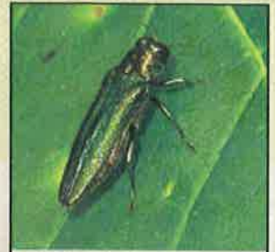
Emerald ash borer adult

The problem: Emerald ash borer is an introduced and destructive pest of all North American true ash ( Fraxinus ) such as white, green, and black/brown ash. Trees infested with emerald ash borer will die from the infestation within 3-5 years. Management strategies to slow the spread of ash mortality are effective at reducing overall emerald ash borer populations, but they may not save the ash tree in front of your house or in your park. Potential costs associated with emerald ash borer for municipalities and homeowners include: