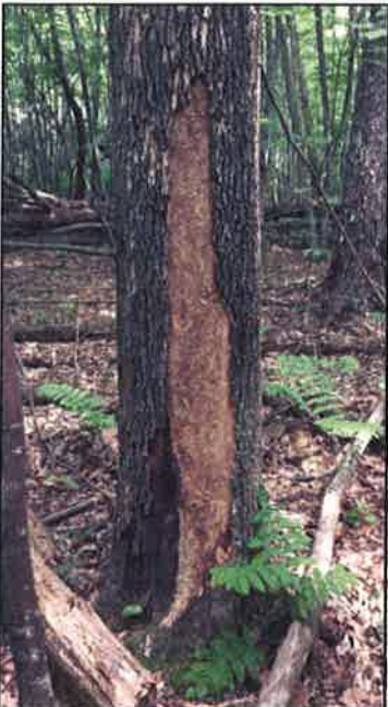
Emerald ash borer killed tree in Concord, NH.