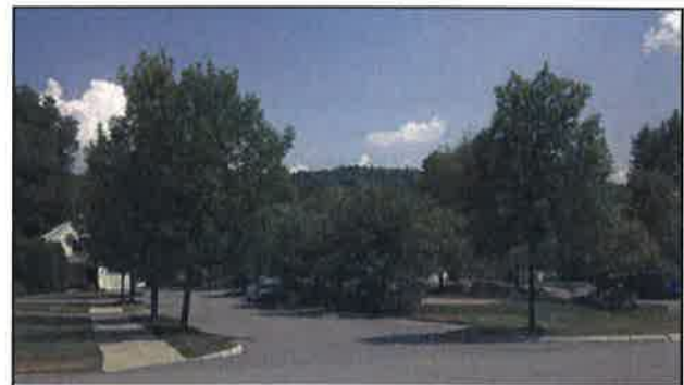
Ash-lined neighborhood in Lebanon, NH.

Although you cannot control the arrival of emerald ash borer on your property, you can decide what impact emerald ash borer will have by developing an emerald ash borer plan. This should be done regardless of proximity to known emerald ash borer populations. The first step is to stay informed about known emerald ash borer populations in the state ( www.nhbugs.org ). Next, determine if you have ash trees, what size they are, where they are located, and if they add value to your property or community. Use local foresters and arborists, on-line calculators ( www.extension.entm.purdue.edu/treecomputer/ and other sites) or smart phone apps (ARBORJETP for iphone and ipad and others) to estimate the costs associated with tree removal, replacement or treatment. Once you have determined your investment in ash and considered your budget, you can develop a plan for which trees will be removed, replaced or treated with insecticides when emerald ash borer arrives. Having a plan empowers you to make informed decisions about your property or community.